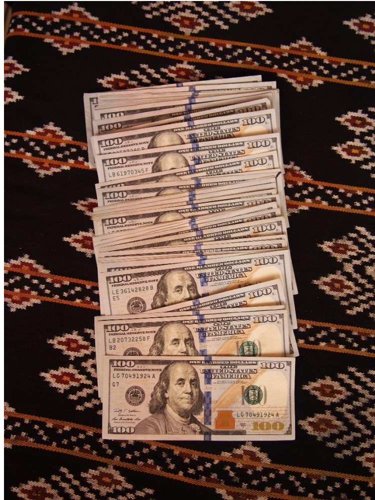
32,000USD which crew members told Amnesty International was paid to them by the Australian officials around 24 May 2015

The Indonesian police who detained the crew have confirmed publicly and to Amnesty International that the men had approximately 32,000 USD in their possession when they were apprehended. The police confiscated the money, and as of 19 August 2015, it was still in their possession. While on Rote Island in August 2015 Amnesty International researchers saw the money that was found on the crew, which consisted of dozens of new-looking 100 USD bills (see photograph), as well as a document listing the serial numbers of all the bills.