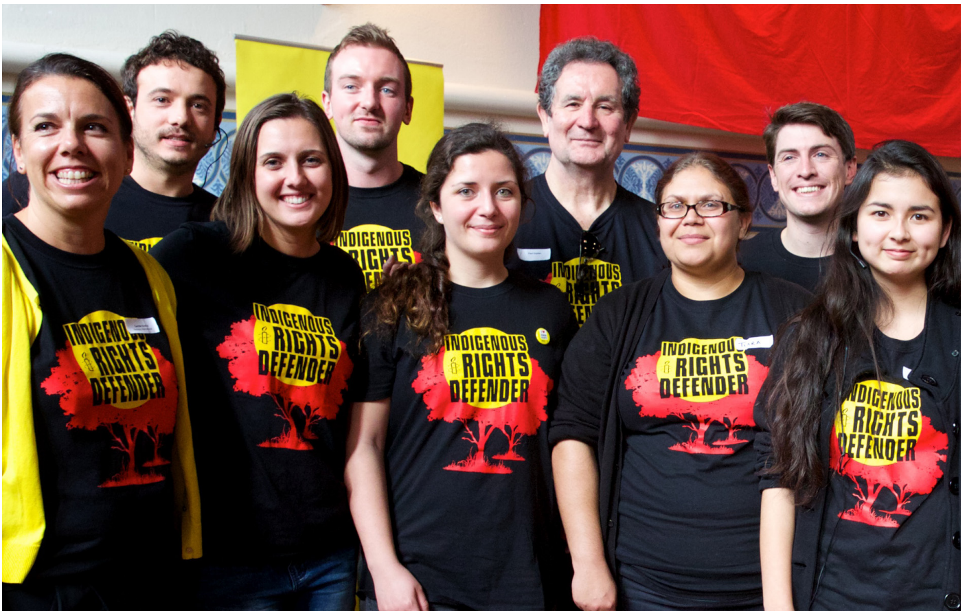
Activists at the Perth launch of the Community is Everything campaign.

Our power grows with each conversation you have! Your work on this campaign will mean we will be stronger in the future. The more people who sign up, the more we can build our movement and the more powerful we become.