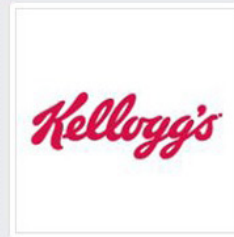
Kellogg's Australia @KelloggAU