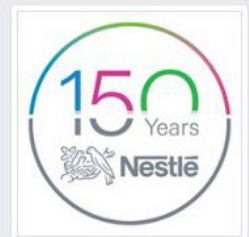
Nestlé ✓ @NestleAuNZ