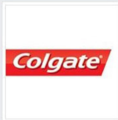
Colgate ✓ @Colgate