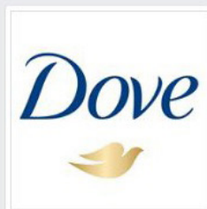
Dove ✓ @DoveAUS