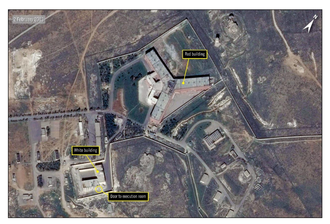
Satellite image of Saydnaya Military Prison. Coordinates 33.6648°, 36.3288°

The following information is based on information from individuals who have witnessed hangings at Saydnaya since 2011. According to these witnesses, the vehicles depart the red building and enter the perimeter of the white building, usually between 12am and 3am. The vehicles drive around the corner of the white building and stop in front of the "execution room" which is located in the south-east corner of the building. The "execution room" is located in the basement level, under the room on the ground floor where the family visits are conducted for detainees held in the white building. The room is accessed from an external door made of steel, which is below the ground level and preceded by a stairway. The white building is situated on a slope, and at the highest point, the street level is 1m below the ceiling of the room.