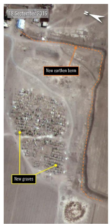
Najha cemetery: Only 300 metres east of buildings in Najha, a small cemetery is visible from imagery from 6 August 2009. The cemetery does not expand significantly until 2014. On 3 June 2014, one vehicle can be seen next to newly dug graves in the image. On 18 September 2016, approximately 125 new graves are visible since 2010. A new earthen berm is also visible, possibly constructed to better secure the town.

Coordinates 33.3844°, 36.3824°.