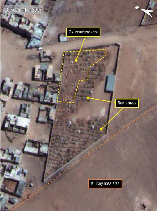
On 3 March 2010, imagery shows a small cemetery approximately 500 metres north of Najha, adjacent to a military base. In 2011, walls were erected around the cemetery though the number of graves only began to increase significantly, according to available imagery, after August 2013. On 18 September 2016, imagery shows the graves in the cemetery have more than doubled.

Coordinates 33.3927°, 36.3685°. Left image: Google Earth © 2016 DigitalGlobe, right image: © 2016 DigitalGlobe, Inc.