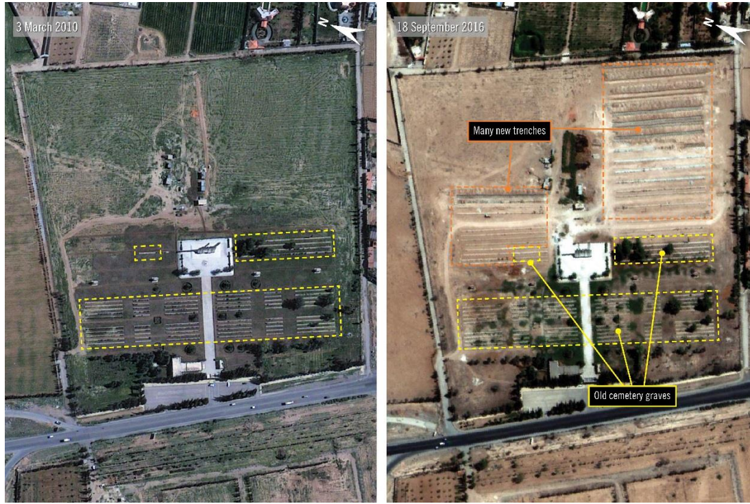
The Martyrs Cemetery is located south of Damascus, along the road to Najha. In 2010, imagery shows cemetery with graves in a strategic layout with carefully designed columns and rows. In 2013, new 90 metre long trenches begin to appear over the course of the year continuing into 2014. By 18 September 2016, imagery shows the grave area has more than doubled in size with additional 90 metre long trenches. Coordinates 33.4114°, 36.3697°. Left image: Google Earth © 2016 DigitalGlobe, right image: © 2016 DigitalGlobe, Inc.