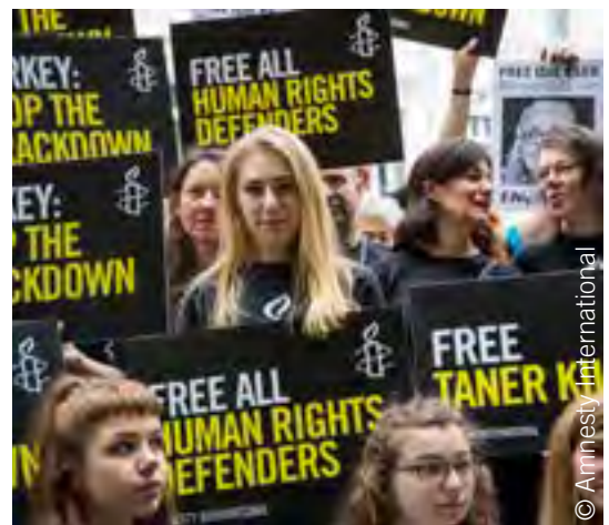
Demonstration outside the Turkish Embassy in London, UK. 12 July 2017.

Our work protects and empowers people – from abolishing the death penalty to advancing sexual and reproductive rights , and from combating discrimination to defending refugees' and migrants' rights . We help to bring torturers to justice. Change oppressive laws... And free people who have been jailed just for voicing their opinion. We speak out for anyone and everyone whose freedom or dignity are under threat.