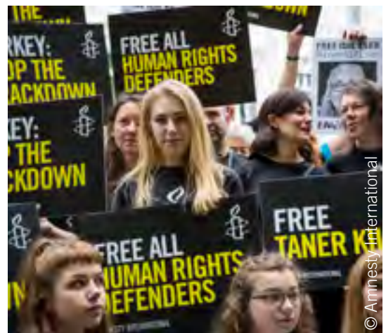
Demonstration outside the Turkish Embassy in London, UK. 12 July 2017.

Our work protects and empowers people – from abolishing the death penalty to advancing sexual and reproductive rights , and from combating discrimination to defending refugees' and migrants' rights . We help to bring torturers to justice. Change oppressive laws... And free people who have been jailed just for voicing their opinion. We speak out for anyone and everyone whose freedom or dignity are under threat.