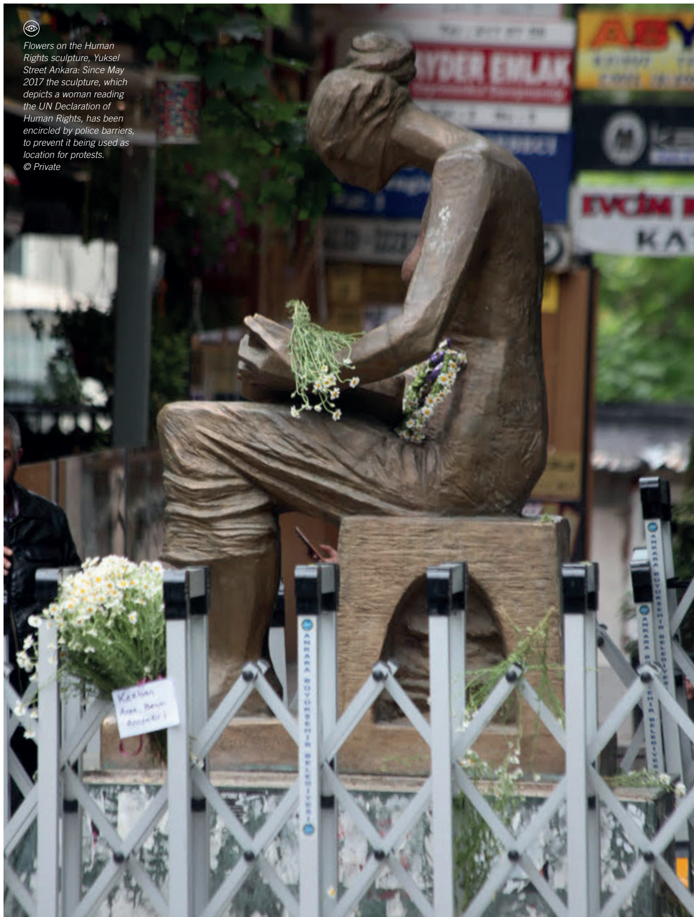
Flowers on the Human Rights sculpture, Yuksel Street Ankara. Since May 2017 the sculpture, which depicts a woman reading the UN Declaration of Human Rights, has been encircled by police barriers, to prevent it being used as location for protests.

“I have a small bag ready at home. Every morning I contact two people [to let them know I am still here]. I am prepared for what may come.”