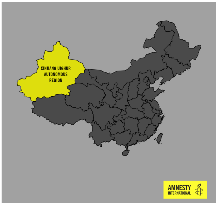
Map of the People's Republic of China showing the Xinjiang Uighur Autonomous Region in yellow.

Rich in coal, natural gas and oil and sharing borders with eight different countries, the XUAR is intertwined with many of China's economic, strategic and foreign policy goals. But decades of inter-ethnic tensions have led to cycles of sporadic violence and heavy-handed repression. China's leaders now consider stability in the XUAR vital to the success of the "Belt and Road Initiative", a massive global infrastructure development programme aimed at strengthening China's links to Central Asia and beyond. 1