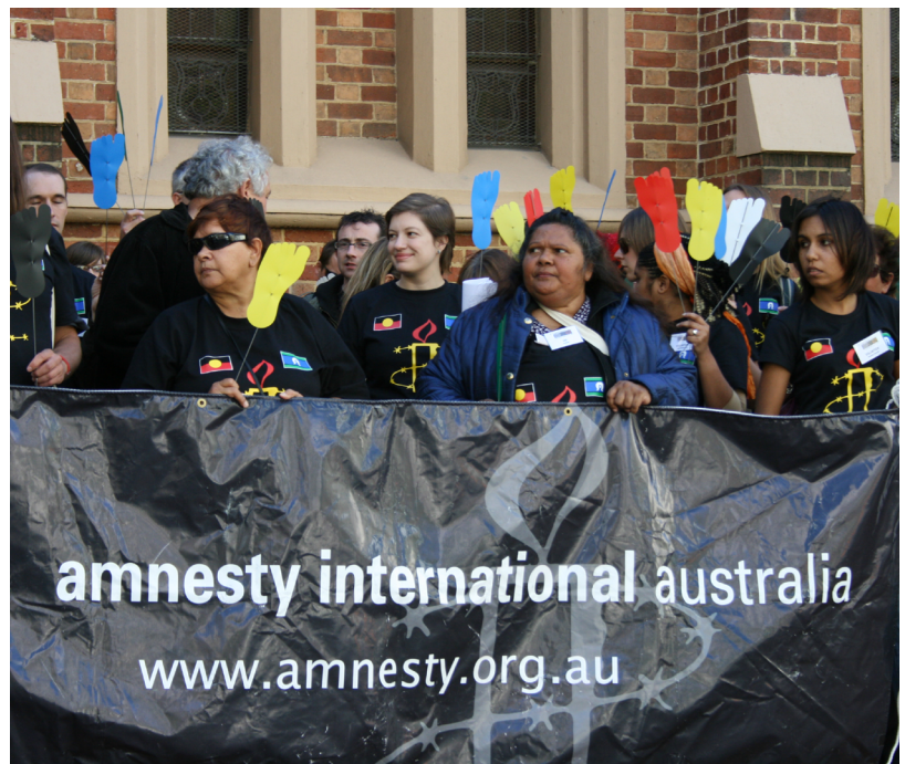
2007 annual general meeting.

If you have any questions please get in touch with us at communityorganising@amnesty.org.au .