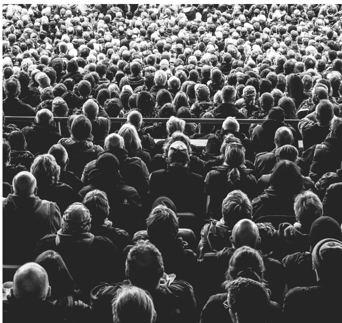
Your audience waiting to be inspired and influenced.

Our communications also need to reach and mobilise more people. Because more people means more power. We each have a voice and the power to shift public discourse, we can all influence others in some way. Through this module you will learn our core concepts to create meaningful communications. You will be able to explain who we are, why human rights matter and inspire more people to get involved.