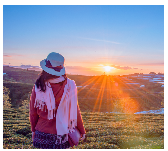
This might not be relaxing to you at all, so find what suits you.

Other methods include things like meditation and exercise. It's about healthy ways of clearing your mind for a short amount of time. Different people need different methods.