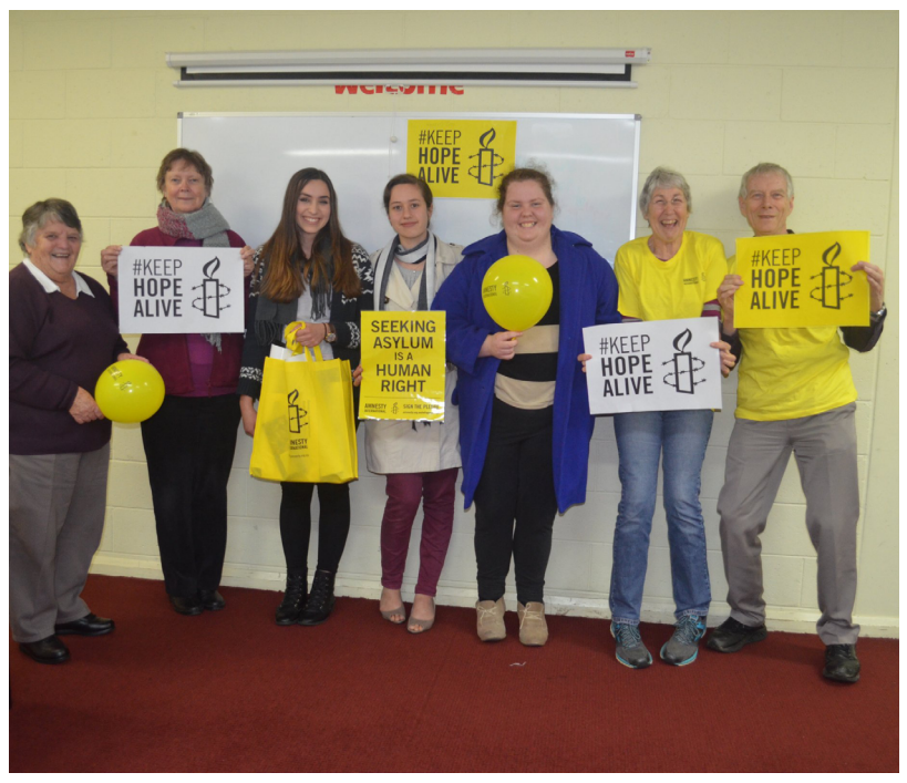
Keep Hope Alive activists 2015.

If you have any questions please get in touch with us at <u>communityorganising@amnesty.org.</u> <u>au</u>.