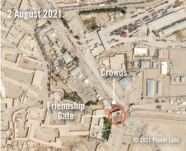
Spin Boldak border crossing. 2 August 2021.

Afghans who tried to cross land borders, an Afghan researcher, and the UN agency in charge of refugees (UNHCR), all told Amnesty International that the Afghan people were also prevented from seeking refuge abroad because most of the land border crossings were closed for asylum seekers. 185