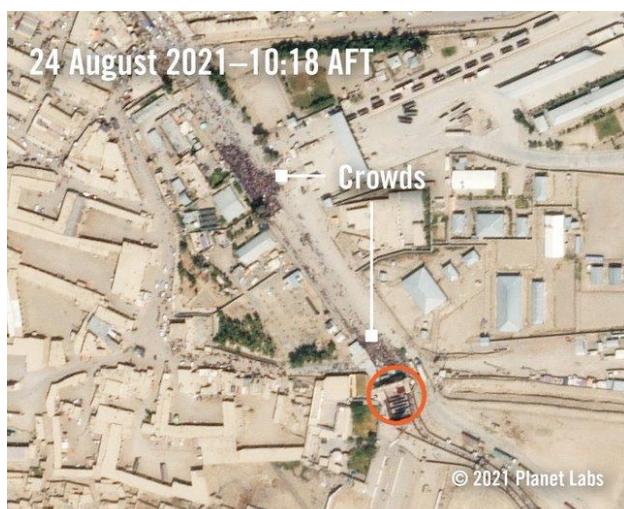
Spin Boldak-Chaman crossing. 24 August 2021.

For instance, according to UNHCR, Pakistan closed its border with Afghanistan, except for people in need of medical treatment, or with a proof of residency. 186 Despite that, at the Spin Boldak-Chaman border crossing in Kandahar, people with Tazkira (National ID Card) from Kandahar, Helmand, Zabul, and Uruzgan were allowed to cross the border. Between 2 August 2021 and 24 August 2021, the crowds attempting to cross the border to Pakistan via the Spin Boldak crossing increased exponentially, as documented via satellite imagery (see above) and video analysed by Amnesty International.