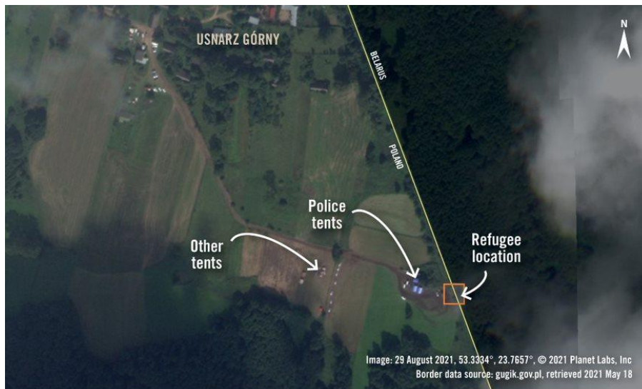
Poland-Belarus Border. 29 August 2021.

“Now we are in a country where we don’t know the language. Do we have the energy to start from zero? No one wanted to leave- but we are forced to go” 191