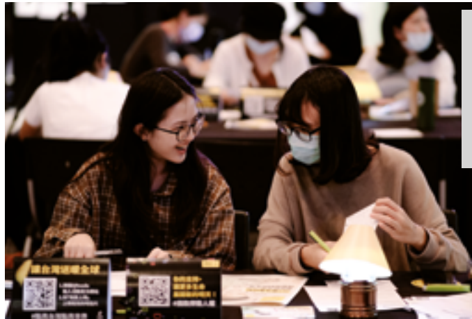
Amnesty International Taiwan letter writing event, December 2020.

Alongside the letter writing actions, Amnesty also speaks to those who have the power to change these people's situations, such as politicians in their