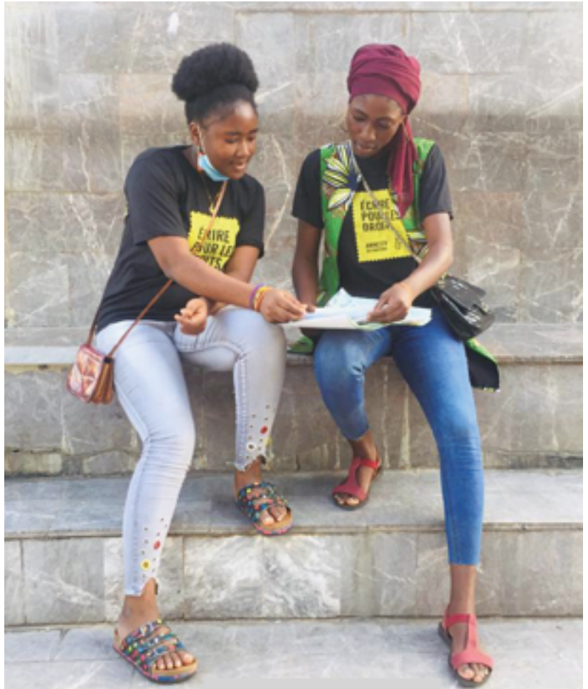
Amnesty International Benin letter writing event, December 2020.

Human rights are not luxuries to be met only when practicalities allow.